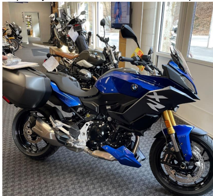
Her New 2023 F900XR