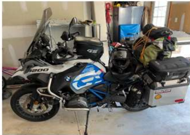
Quiet Night before