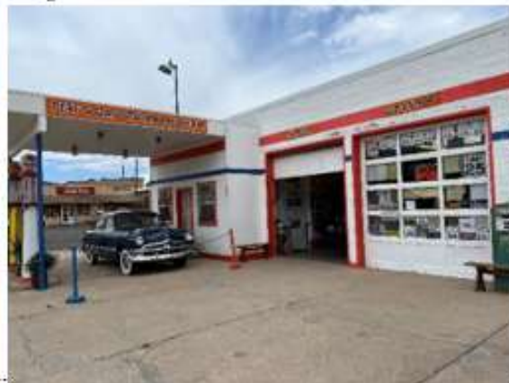
Random Sights along Route 66 ¶

I need to mention one (near) catastrophe I experienced in Gallup, NM. After noticing that both of my tires were a couple pounds low, I decided (against my better judgement it would turn out) to stop at a gas station/truck stop to top off. Big mistake. The air pump was defective so instead of putting air into my rear tire, it let a good amount out! The rear tire was now reading a very low pressure of 25 psi and the TFT was screaming at me (in RED!) not to continue. Somewhat panicking (since I was literally out in the middle of nowhere), I found a worker, Ignacio ("Nas" to friends—and he certainly became one for me!) at the Love's truck stop I was at who offered the use of his 12V pump and his car battery to top me off. I quickly learned two (2) lessons: ¶