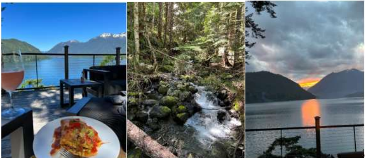
Lake Cushman, WA Sights

Pulled into Lake Cushman, WA in the Olympic National Forest a few days later to spend some time with my cousin (who's been like my brother for the past 52 years) and his wife. Enjoyed hiking, dining, and enjoying a few adult beverages. Good times!