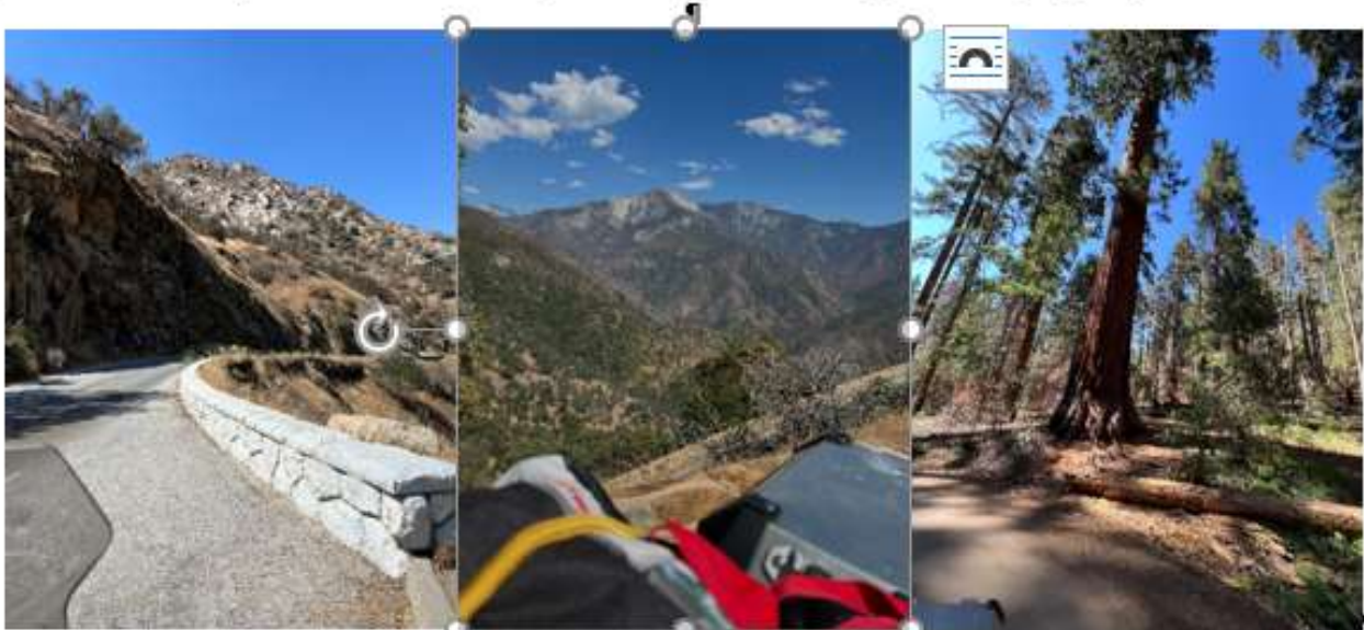
Kings Canyon and Sequoia National Parks

After spending a few days with my relatives in Palm Springs and visiting Joshua Tree National Park, I took off north towards Kings Canyon and Sequoia National Parks. CA-198 (or "Generals Highway") climbs up over 7000 feet in elevation through both those parks, with plenty of switchbacks and tight turns to navigate all while trying to enjoy the spectacular scenery! Very hot coming out of the mountains however—107 F near Fresno, CA. Decided to make a run for the coast and pulled into Santa Cruz, CA later that evening around 10PM. For the next couple days, I enjoyed cooler temperatures as I rode up the coast of California, over the Golden Gate Bridge and along Highways 1 and 101.