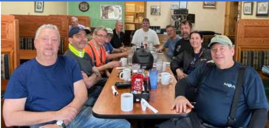
10 "Beemers" Enjoying Breakfast on the Road at Joey's Bakery and Restaurant in Ridgway, PA during the May 'US Route 6 Trip - at the end of Rt 120. Great Stop! Good Coffee! (Missed Ya Tim!)