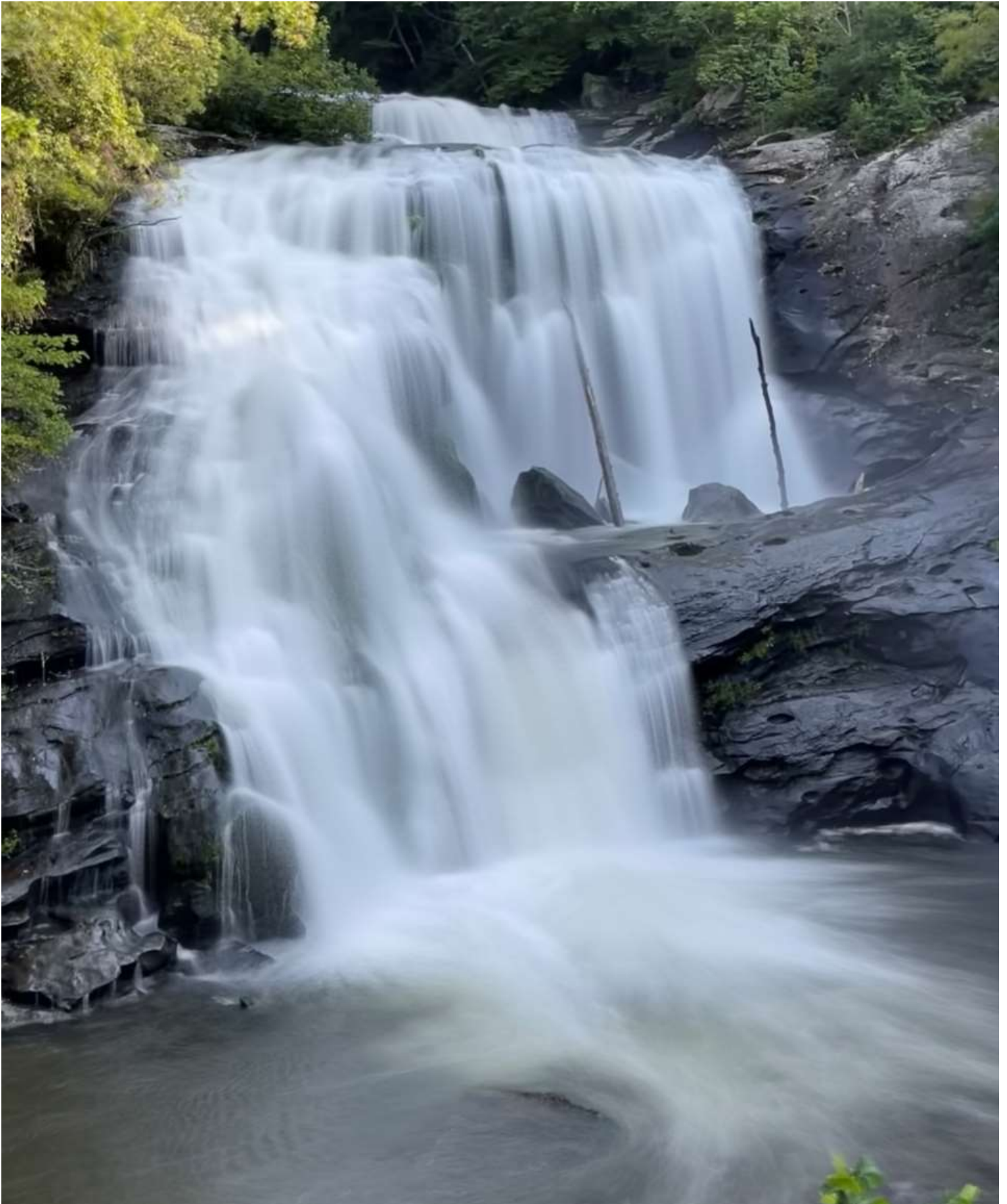
Figure 4 – Bald River Falls Along the Cherahola Skyway, Tennessee (Taken with my iPhone)